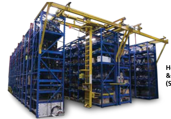
Heavy Pallet Storage & Retrieval Systems (STAK System)