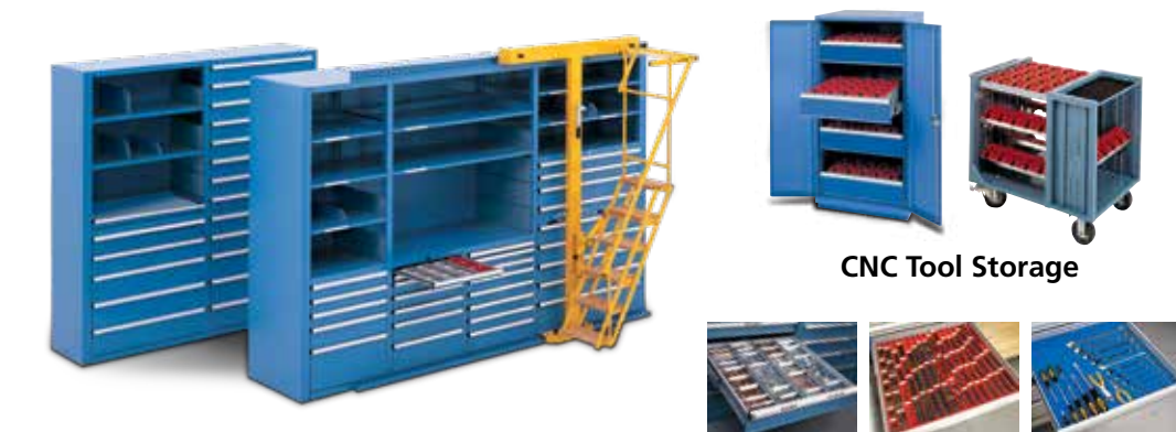
Wall Systems (Storage Wall®)