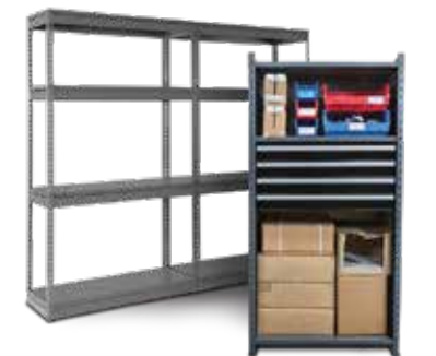
Shelving and Shelf Converter