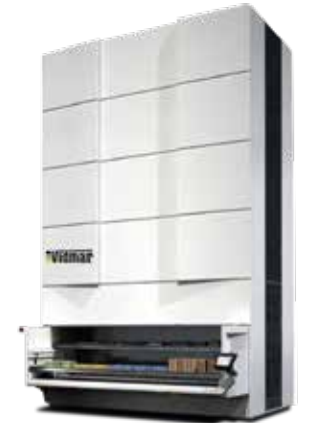
Vertical Lift Module (VLM) Automated Storage & Retrieval System