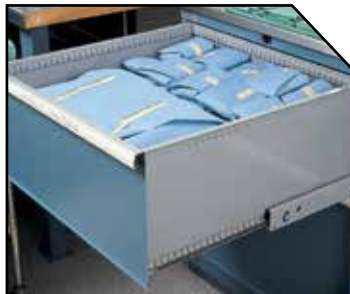
Six different full sidewall height drawers