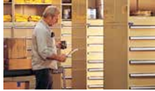
Maintenance & Repair