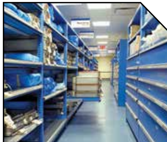
Adjustable drawers, shelves and trays