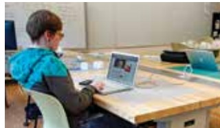
Education & Training