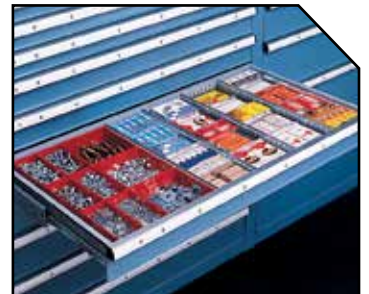
Customizable drawer layouts

For the optimum use of space, Storage Wall® Systems have it all: