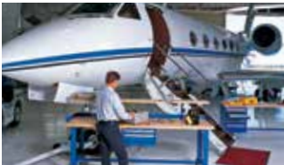
Aviation Service & Repair