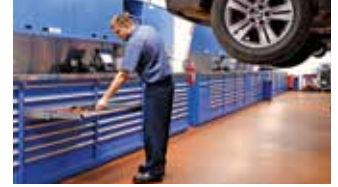
Vehicle & Engine Service & Repair