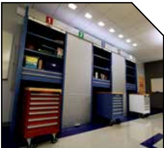
Six stackable heights