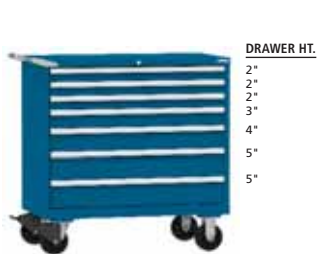
HS0750-0708FL-M Large Mobile Toolbox – 7 Drawers 40 ¼" W x 22 ½" D x 41 ½" H 7 drawers with 165 lb. capacity and mesh drawer liners Includes 6" casters, handle Individual lock