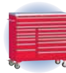
TECHNICIAN SERIES TOOLBOXES