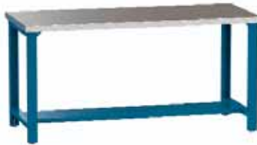
Heavy-Duty 72" Workbench Includes 2 legs, 60" W X 12" D bottom shelf WB82-72BT with Butcher Block Top WB85-72GT with Galvanized Steel Top