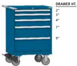
ST0750-0505FL-M Mobile Toolbox – 5 Drawers 28 ¼" W x 22 ½" D x 41 ½" H 5 drawers with 165 lb. capacity and mesh drawer liners Includes 6" casters, handle Individual lock