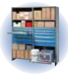
SHELF CONVERTER® SYSTEM