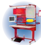
ADJUSTABLE HEIGHT WORKSTATIONS