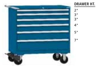
HS0750-0604FL-M Large Mobile Toolbox – 6 Drawers 40 ¼" W x 22 ½" D x 41 ½" H 6 drawers with 165 lb. capacity and mesh drawer liners Includes 6" casters, handle Individual lock