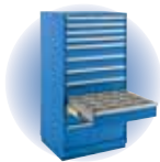
DRAWER STORAGE CABINETS