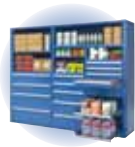
STORAGE WALL® SYSTEM