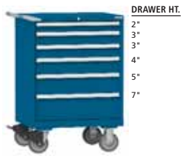
ST0750-0604FL-M Mobile Toolbox – 6 Drawers 28 ¼" W x 22 ½" D x 41 ½" H 6 drawers with 165 lb. capacity and mesh drawer liners Includes 6" casters, handle Individual lock