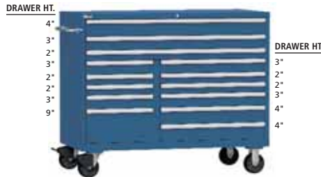
DW0900-C600-1401FL-M Large Mobile Combo Toolbox – 14 Drawers 56 ½" W x 28 ½" D x 47 ¾" H 14 drawers, including 3 full width drawers, with 440 lb. capacity and mesh drawer liners Includes 6" casters, handle Individual lock