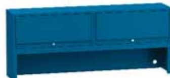
Riser Shelf & Overhead Cabinet Combination steel stationary riser shelf with backstop (15" D x 13½" H) with 16" high overhead cabinet mounted on shelf. Overhead cabi- net has retractable door. SRS/OHC60-16: 60" long with (1) 60" long overhead cabinet SRS/OHC72-16: 72" long with (2) 36" long overhead cabinets