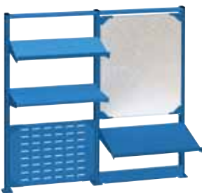
Nexus Accessory System Kit XSSMNX-60/2424 Attaches to top of 60" worksurface, includes (3) adjustable shelves, markerboard/tackboard, louvered panel, back stop and vertical power strip XSSMNX-72/3030 Attaches to top of 72" worksurface